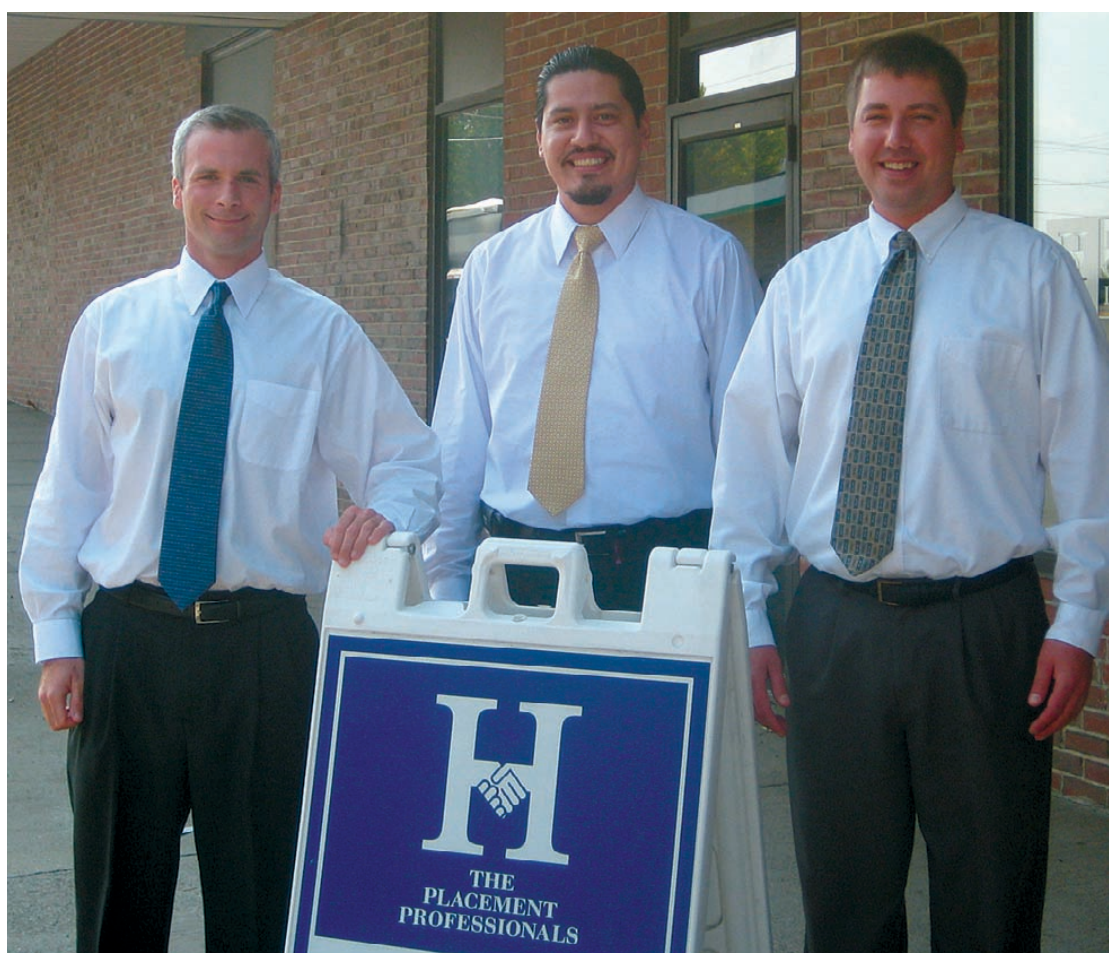
Staffing agencies such as Hamilton Connection are a perfect way to find a perfect job.

Whether you are starting a new career, re-entering the workforce or looking to supplement your income, Express Personnel has the resources to